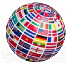
An accredited International College

You can soon be on the way to achieving your study ambitions and career goals with PROFESSIONAL DISTANCE-LEARNING .