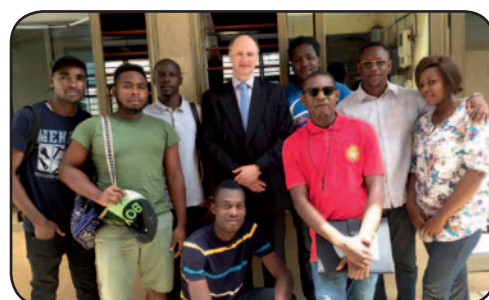
Happy Graduates: 2 from South Sudan, and many from Ghana Members aiming to become Graduates