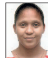
NANE V WILLIAM HONOURS DIPLOMA ADMINISTRATIVE MANAGEMENT (SEYCHELLES)