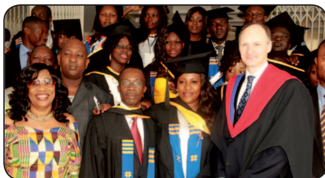
CIC Graduates from Global Executive Institute

CIC's VP and colleagues are interviewed about the importance of high quality education