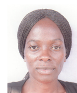
CLEARANCE VETE DIPLOMA CREDIT MANAGEMENT AND CONTROL (ZIMBABWE)