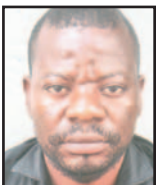
NDAGE NDIMUH BAC/EBA BUSINESS ADMINISTRATION (CAMEROON)