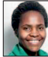
ESNART LIWONDE HONOURS DIPLOMA BUSINESS ADMINISTRATION (SPAIN)