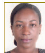
LEMBE WALDA BAC/EBA FINANCE & INVESTMENT (GABON)