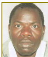
DENFOLD HLUPEKO BAC/EBA FINANCIAL ADMINISTRATION (ZIMBABWE)