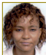
POSTIVNA BETTEY BAC/EBA FINANCIAL ADMINISTRATION (MOROCCO)